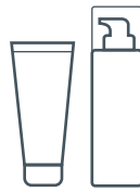
50 ml tube 100 ml dispenser